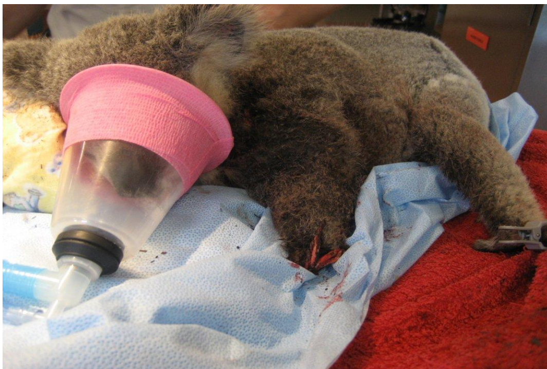
Picture 4.2—Koala with left forepaw injury as a result of a domestic dog attack